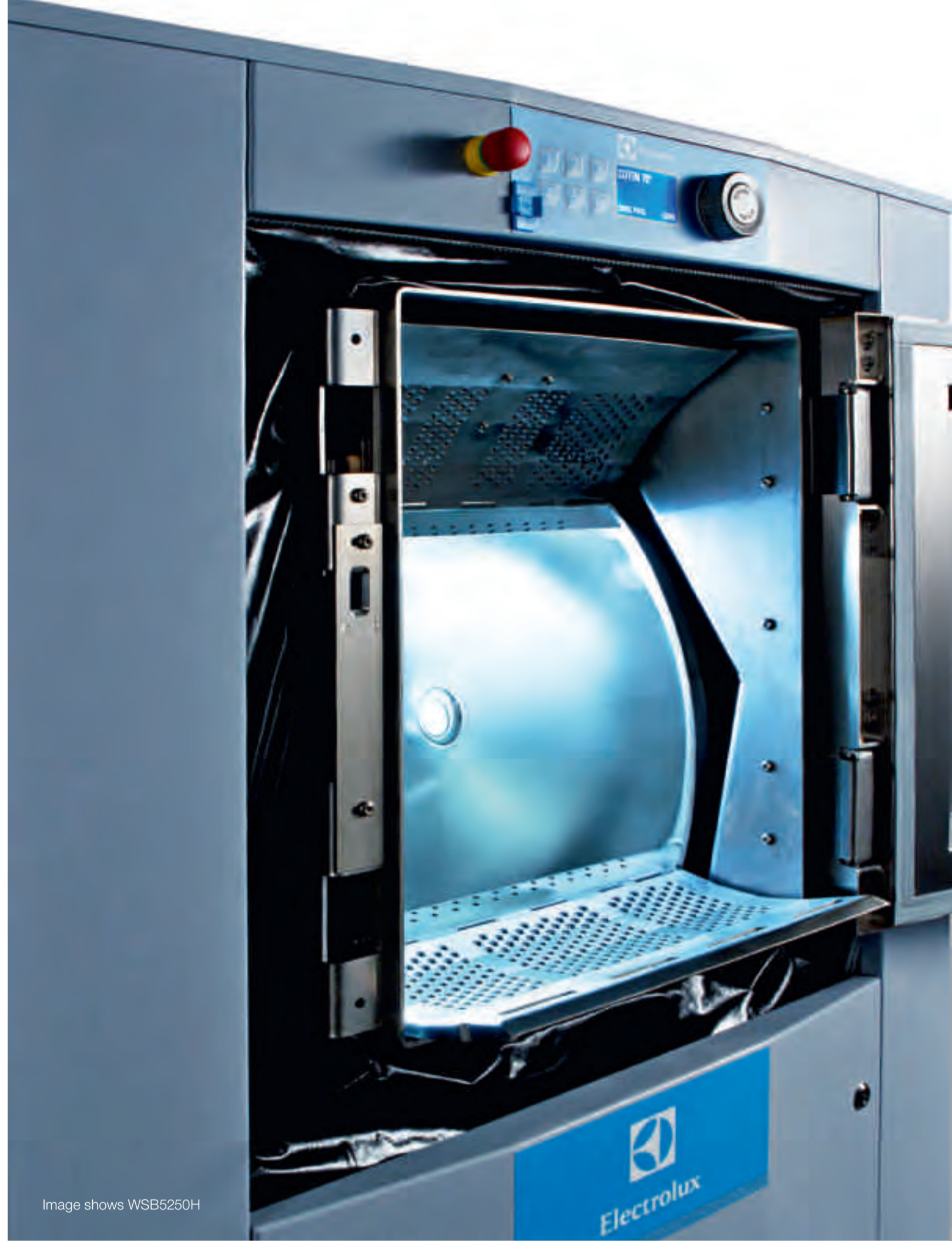
Image shows WSB5250H